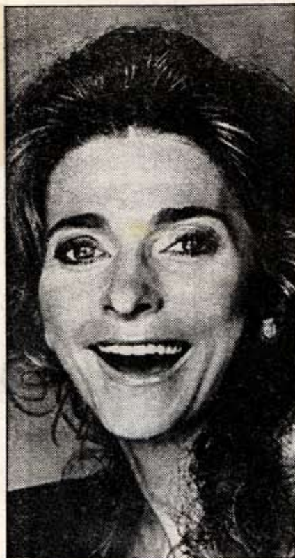
JUDY COLLINS at Seaport, Monday